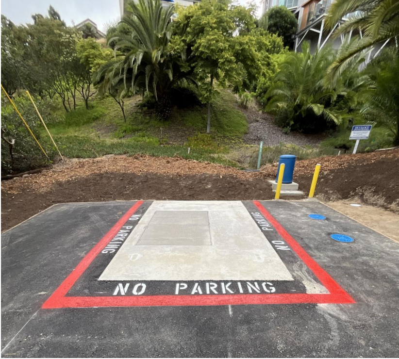
Photo of the completed Caudor Street Pressure Regulating Valve Project